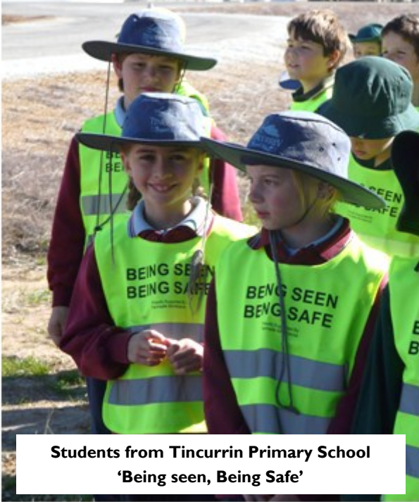
Students from Tincurrin Primary School 'Being seen, Being Safe'