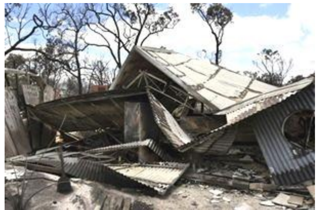
Devastation caused by the Toodyay bushfires

For further details about volunteer fire fighting contact: FESA Headquarters by phone 08 9323 9300 or on the web www.fesa.wa.gov.au or contact your local fire station, FESA Regional or District Office.